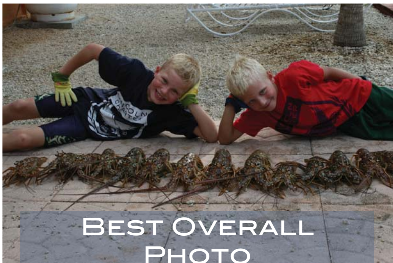
BEST OVERALL PHOTO